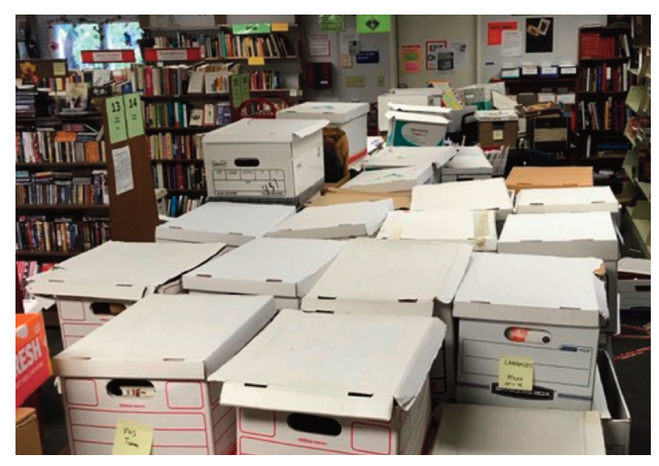
Preparing books headed to the Bargain Room.

obscure, rare and unusual. What they have in common is not a lack of desirability - all that they have in common is their low cost."