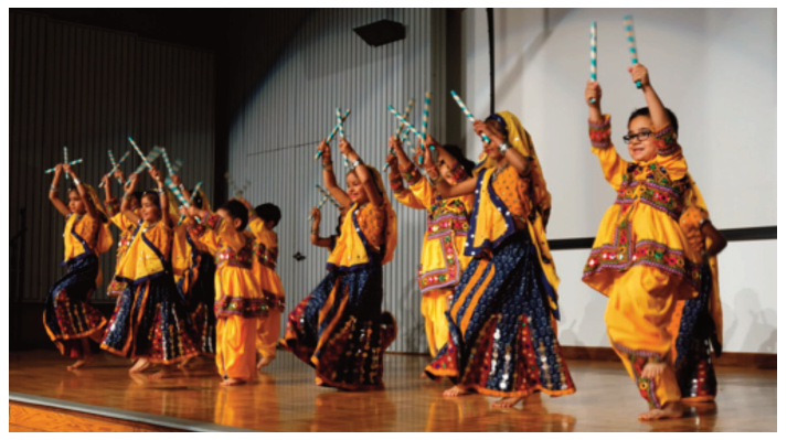
Diwali Celebration (11/10/18)