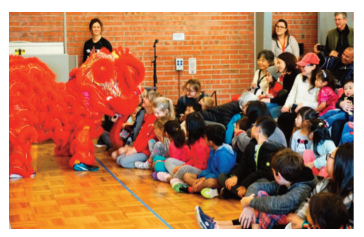
Lunar New Year Festival (2/16/19)

• Writing Contest 2019: The contest was capped off by a reception at the Rinconada Library on Friday, February 1. The event was to celebrate all those who participated in this year's Writing Contest and to announce the winners. 125 entrants and their families attended the event. Binders containing all the entries are available for the public to view at each library branch. Winners will be recognized in an upcoming City Council meeting.