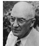
William Carlos Williams