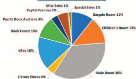
Sales Distribution (2022-23)

EBay sales provide the highest margins but require more work from our volunteers. PBA accepts a very selective number of books, but some of those sales have