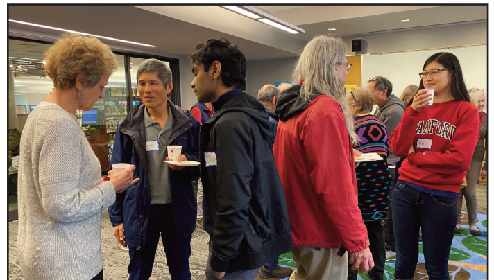
Some veteran volunteers chat