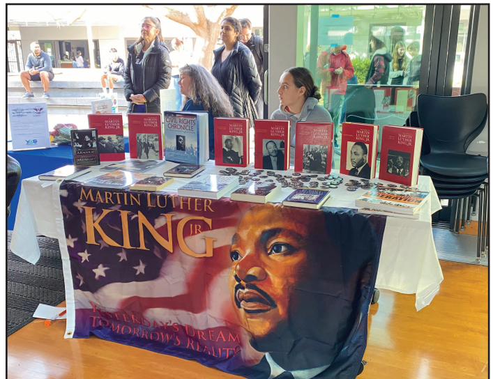
Honoring Dr. King