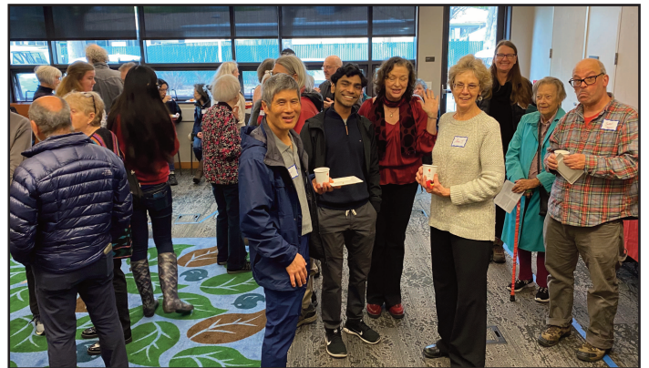
Everyone looks happy - more or less!