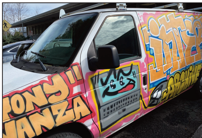
IA's colorful van