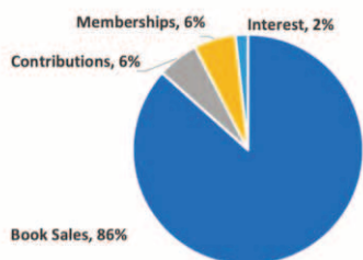
Revenue by Source (2022-23)

The 86% of revenues from book and media sales comprises multiple channels of retail sales. While the bulk of book sales do come from the Cubberley sales