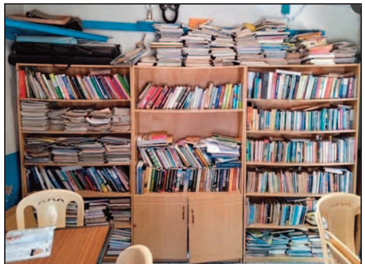
Bookshelves in Kenya! (See article on page 1)