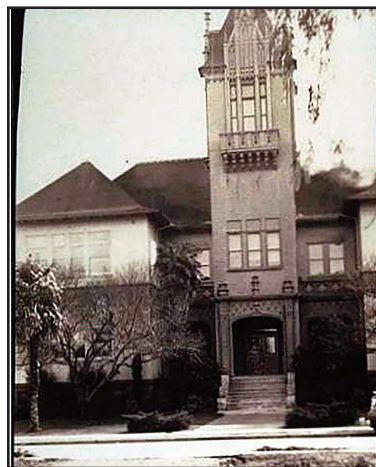
Mayfield Elementary School