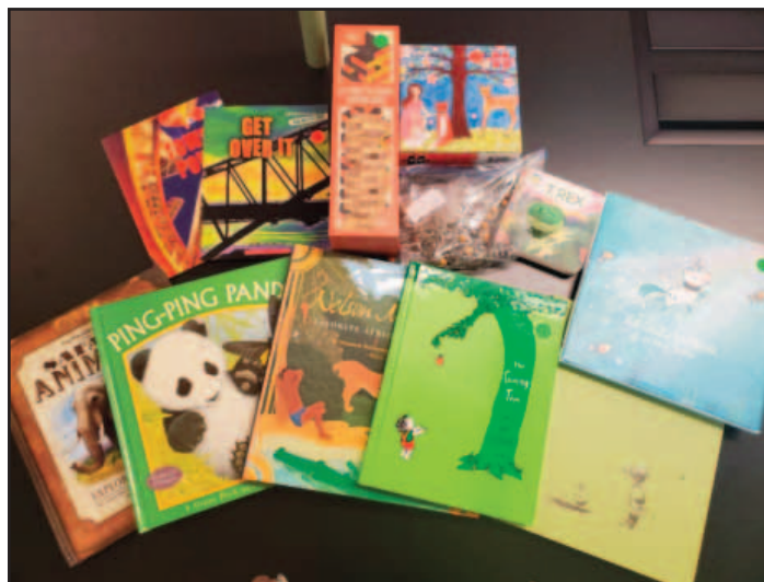
A selection of books and games from FOPAL's Children's Room.