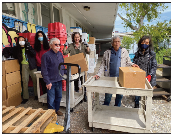
Courtyard clean-up! (See article on page 6)

To volunteer for any of above opportunities please contact Janette Herceg - 650-494-1266 or at jherceg@fopal.org . If you have any questions regarding the type of volunteer opportunities FOPAL offers, please check out our website www.fopal.org