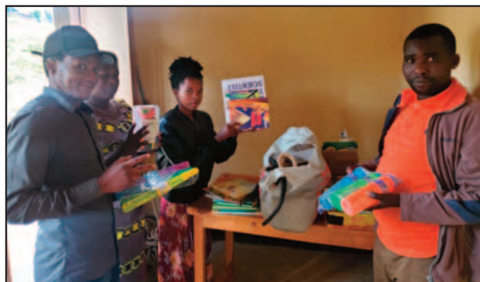
The school's teachers showcasing some of the books and supplies that were donated.