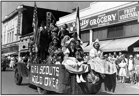
May Fete Parade in 1938

Palo Alto of 1938 was very different from the community we know today.