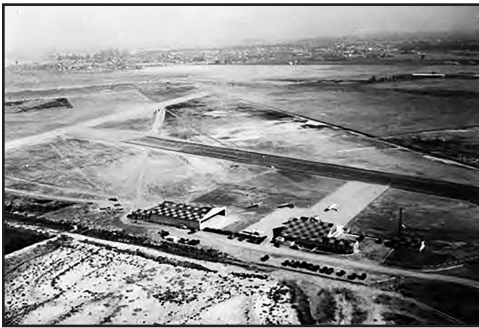
Palo Alto Airport in 1938

The population of Palo Alto was less than the 16,744 residents