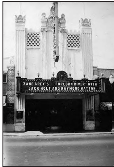
Stanford Theater in 1938

historian, managed the collection of documents in the basement. There had been a branch of the Santa Clara