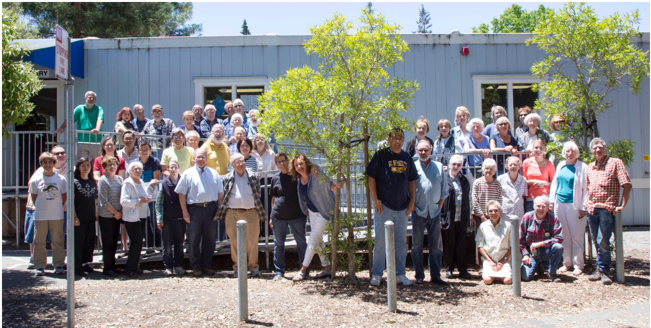
Volunteer Farewell Party

FOPAL sends a big THANK YOU to all for their dedication to community service!